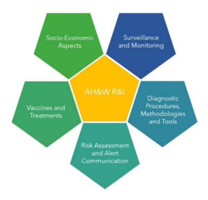
Figure 2. The five priority areas of the EUPAHW

This call aims to enhance animal health and welfare by supporting innovative research to develop novel and improved technologies and addressing fundamental and socioeconomic science questions related to the prevention, detection, assessment, and management of animal health and welfare issues of both terrestrial and aquatic animals.